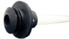
#9172 SINK OVERFLOW TUBES - LARGE - For sink drains 1 1 / 4 , 1 1 / 2 and 1 3 / 4 inches