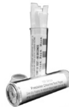
#9124 IODINE TEST STRIPS - For testing solutions of #770 RICHCO BOCK SANITIZING RINSE