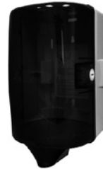
#9123 SMALL CENTER-PULL DISPENSER - Adjustable tension minimizes roping and maximizes perfwing with different towel types - Fits (250-ct.) #1566 and (525-ct.) #1448, #1574 QUICK WIPES - Durable, smoky black plastic - Lock prevents tampering