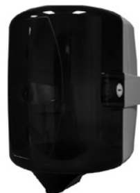
#9125 LARGE CENTER-PULL DISPENSER - Adjustable tension minimizes roping and maximizes perfwing with different towel types - Fits (400-ct.) #1539, (900-ct.) #1567, #1574 FACILITY WIPES - Durable, smoky black plastic - Lock prevents tampering